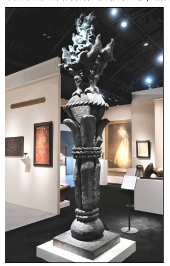
"Lesson of a Disaster" by Jacques Lipschitz, circa 1925. Bernard Goldberg Fine Arts, LLC, New York City.