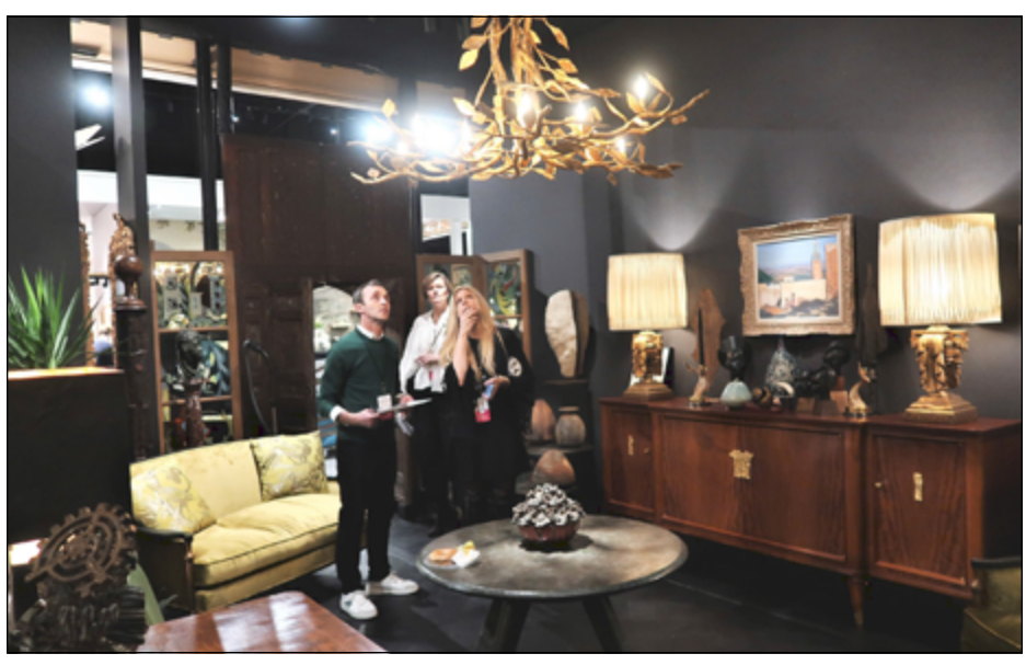
A gilded-bronze chandelier of 2019 by Marc Bankowsky illuminated Maison Gerard's display of Modern and Contemporary design.