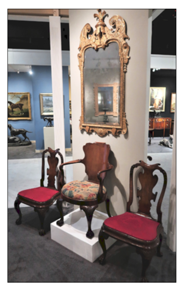
Clinton Howell Antiques, New York City.