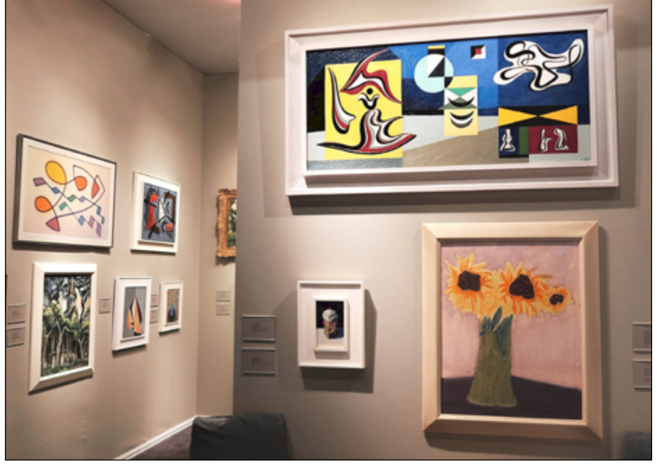
Thomas Colville Fine Art, Guilford, Conn., and New York City.