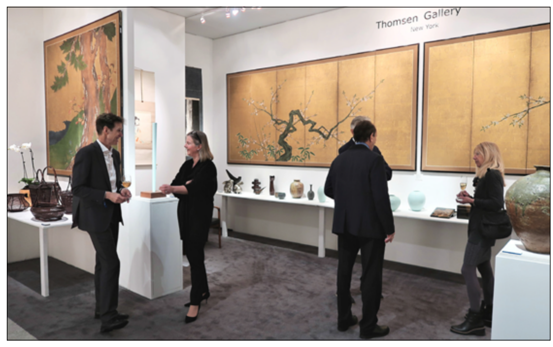
Thomsen Gallery, New York City.