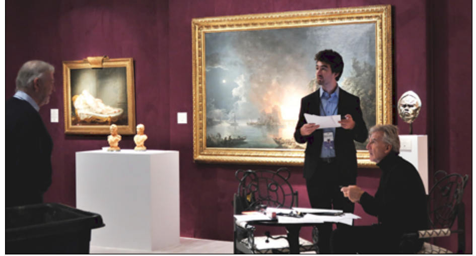
Galerie Perrin, Paris.