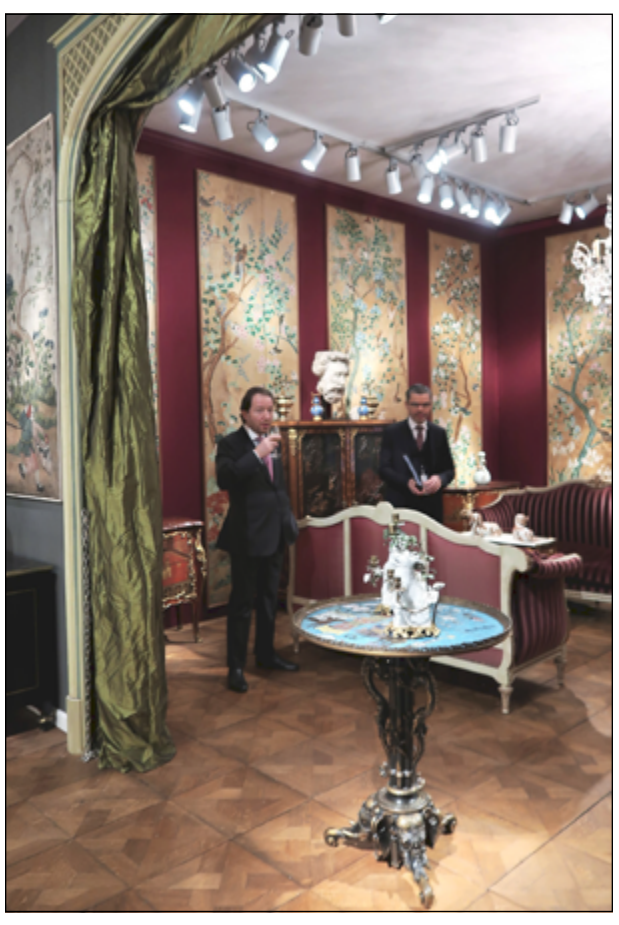
Steinitz Gallery, Paris.