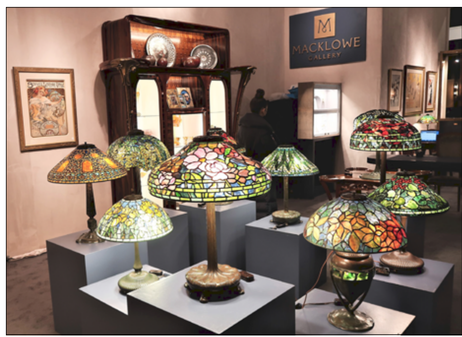
Macklowe Gallery, Ltd, New York City.