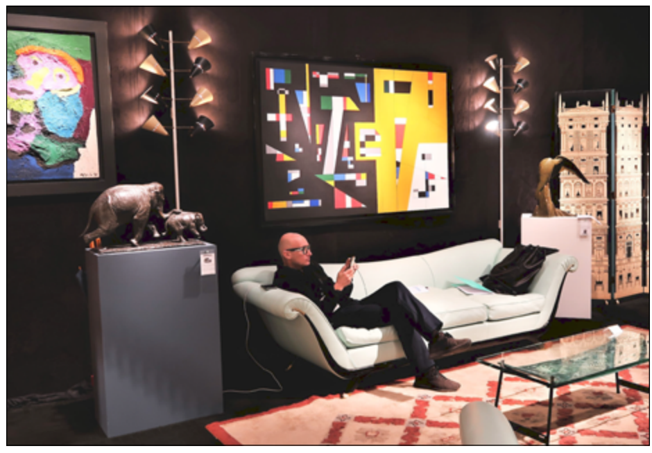
Robertaebasta, Milan and London.