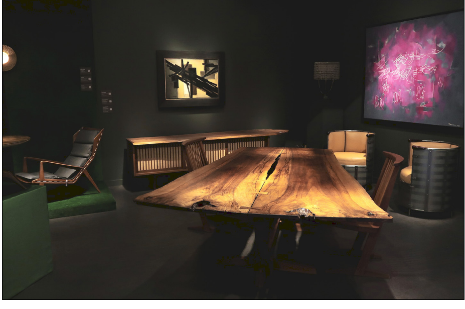
A 1969 "Conoid" dining set by George Nakashima included a table and 10 chairs. Geoffrey Diner Gallery, Washington DC.

to Erving and Joy Wolf. Levy also wrote up its Potter family Chippendale tall case clock, a Providence, R.I., example of 1785; two pairs of side chairs; a worktable; and a captivating folk watercolor of the DeWolf family of Bristol, R.I.