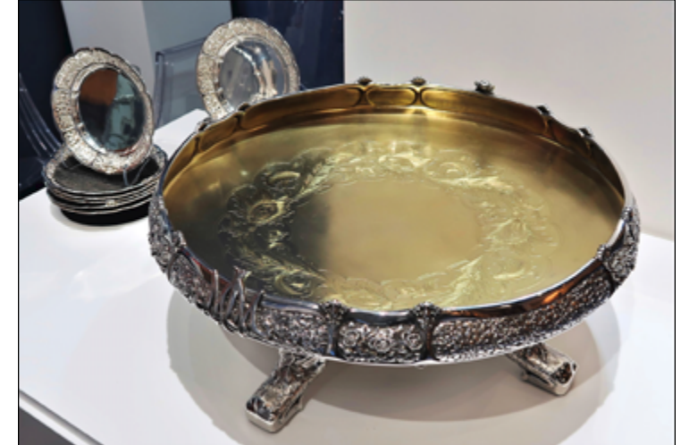
This American gilt-silver ice-cream service from "The Mackay Service," Tiffany & Co, 1878, sold early in the show at Spencer Marks, Southampton, Mass.