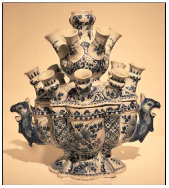
Delft flower vase and cover signed by Adrianus Kocx, De Grieksche A factory, 1695. Aronson of Amsterdam, The Netherlands.