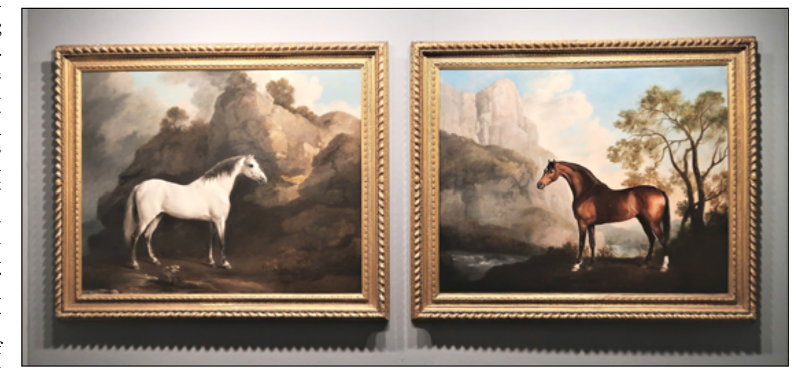
"Gregory's Grey Arabian, later Rycote Arabian" and "Gregory's Bay Arabian" by George Stubbs. Rountree Tryon Galleries, London.