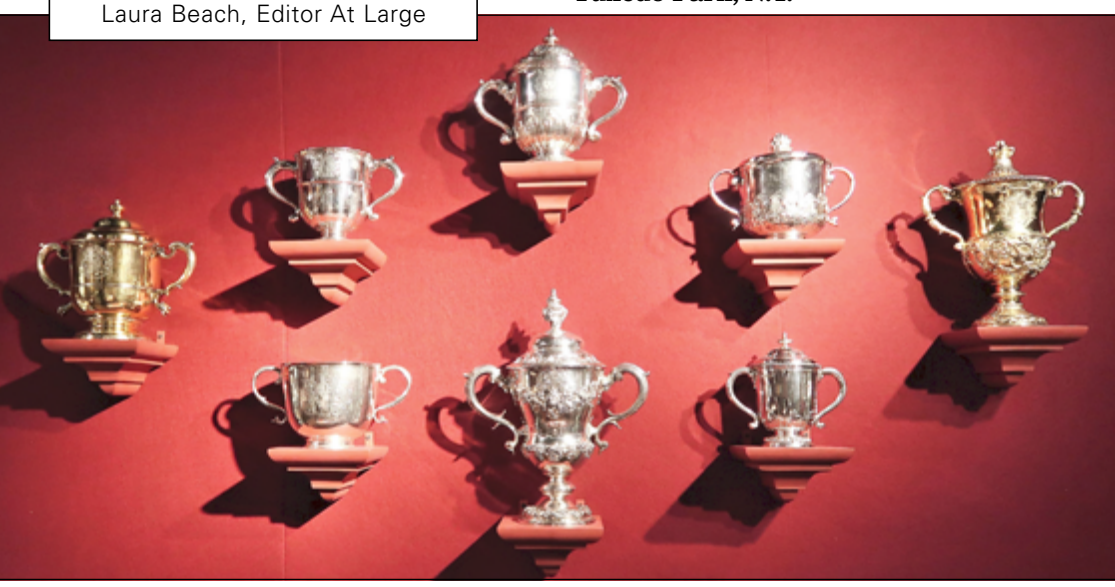
A collection of two-handled silver and silver-gilt cups, some with covers, at S.J. Shrubsole, New York City.