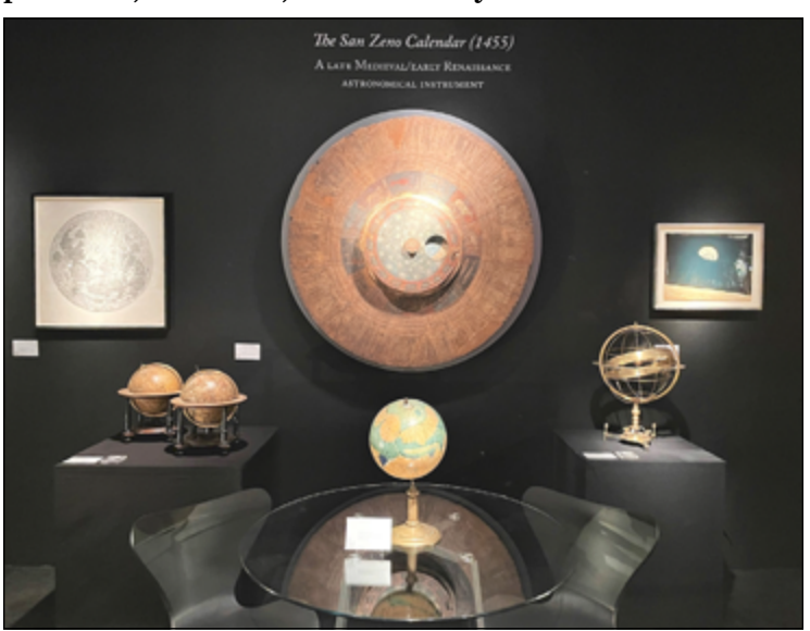
Daniel Crouch Rare Books of London invoked the night sky with 500 years of celestial artifacts. Above center, a late medieval/early Renaissance volvelle astronomical calendar from the San Zeno cloister, circa 1455.