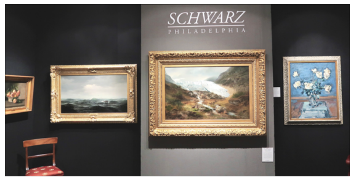
Flanking "Landscape with Glacier" by Herman Herzog, center, is "Ocean Waves" by Edward Moran, left, and, right, "Yellow Roses on Blue" by Franz Rederer. Schwarz Gallery, Philadelphia.

NEW YORK CITY — A festive Winter Show celebrated its 69th season with a return to its longtime venue, the Park Avenue Armory. Cancelled in 2021 and postponed in 2022, the show, to the delight of exhibitors and patrons, in 2023 embraced its traditional bastion on New York's Upper East Side, strewing the historic armory with sprays of lilies and roses on opening night, January 19, and beckoning visitors with a lively program of receptions, talks and tours through closing hours on January 29.