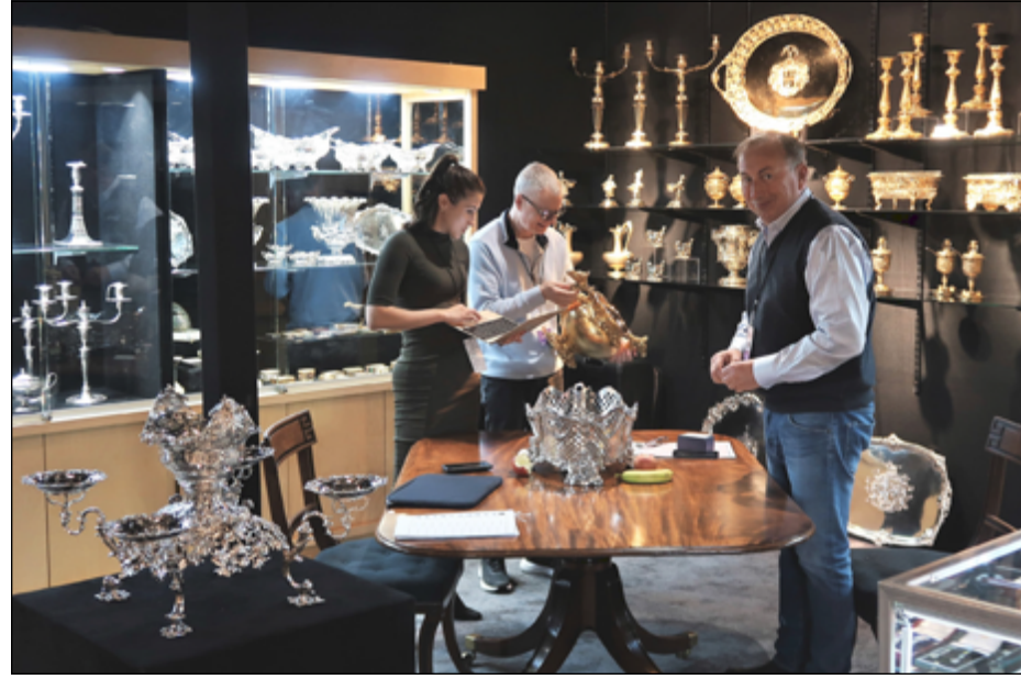
Koopman Rare Art, London.