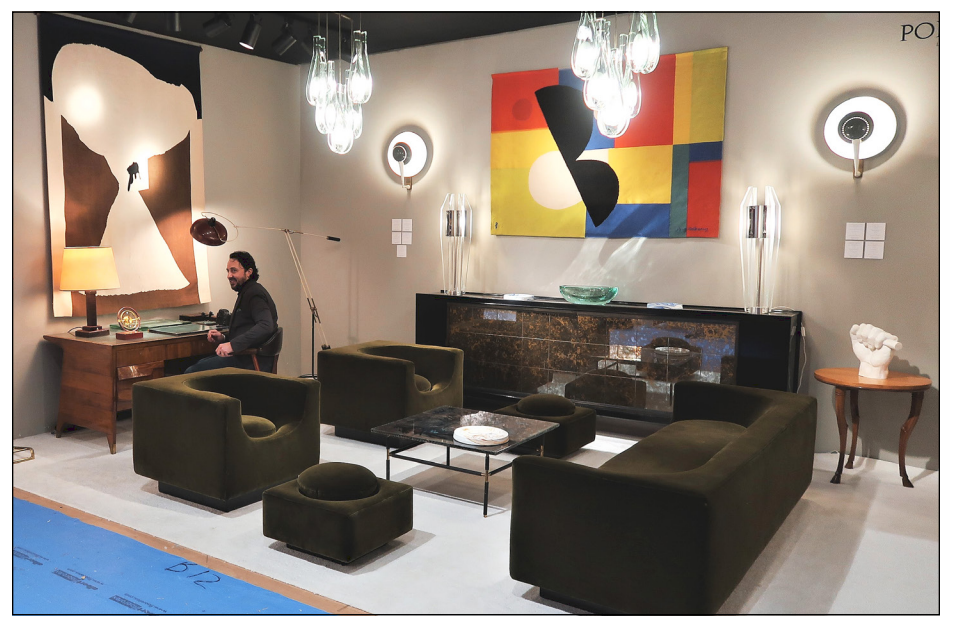
Portuondo Gallery, London and New York City.