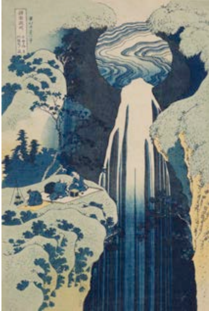
Amida Waterfall on the Kisokaido by Hokusai