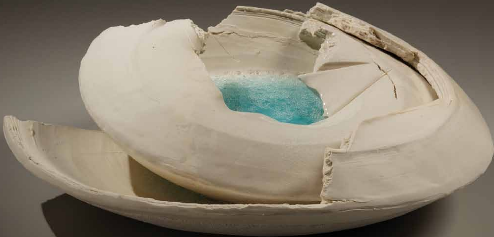
This page: Layered sculpture, 2014 Unglazed multi-fired porcelain with pooled glass 5 1/2 x 18 1/2 x 15 3/8 inches