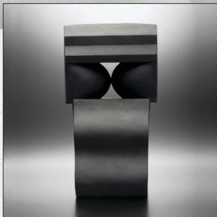
Interconnection '15-1, 2015 18 1/2 x 9 5/8 x 6 1/4 inches