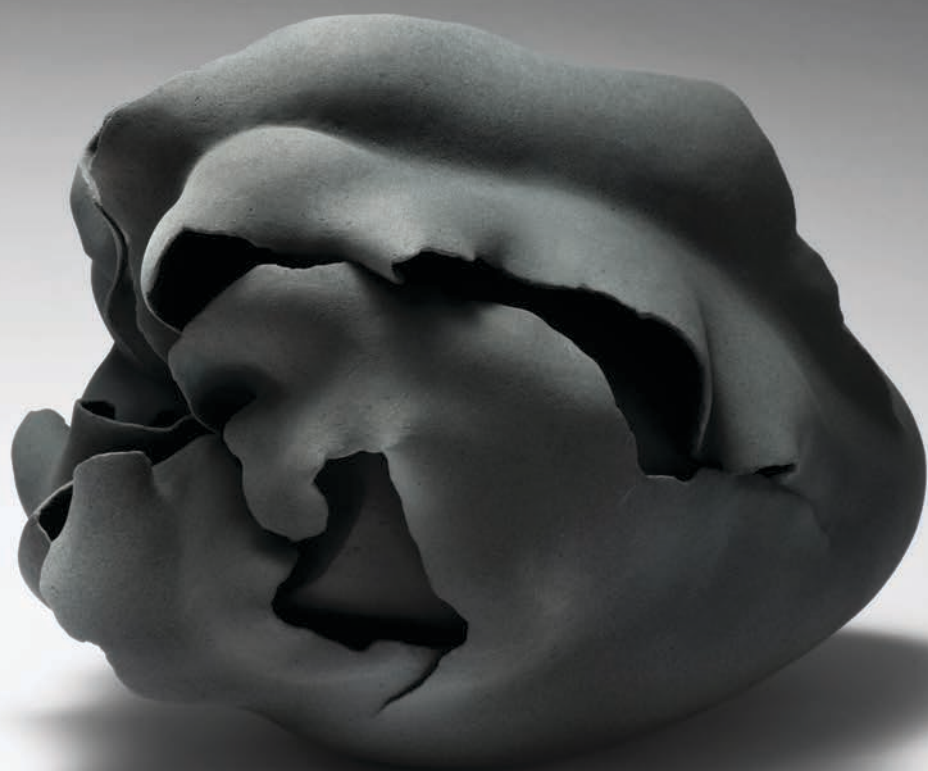
Interconnection '15-4, 2015 16 x 19 1/4 x 15 1/8 inches