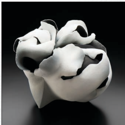
Interconnection '15-6, 2015 13 x 15 x 14 1/2 inches