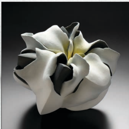
Interconnection '15-10, 2015 11 x 14 x 13 inches