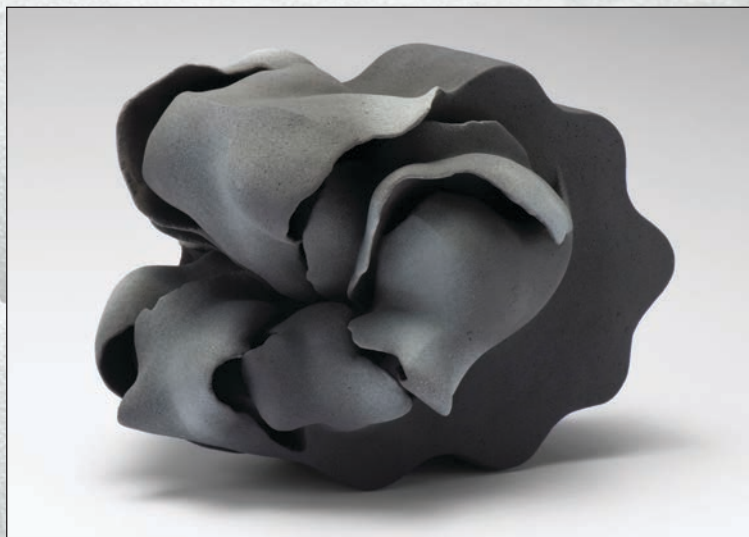
Interconnection '15-8, 2015 11 3/8 x 15 3/8 x 14 1/8 inches