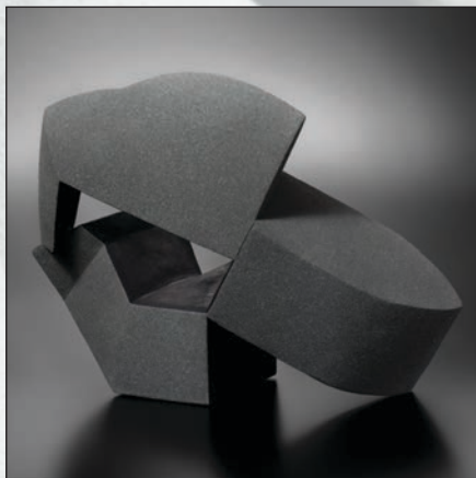
Interconnection '15-3, 2015 14 1/8 x 19 1/4 x 9 inches