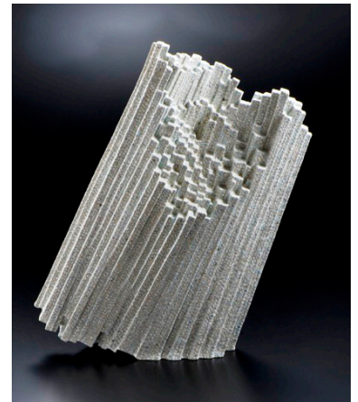
Compilation of Recollected Images 2017 Shigaraki stoneware with colored-clay chamotte inlays 22 x 18 7/8 x 6 3/4 in.

For further information and high-resolution images, please contact the gallery director, Tracy Causey-Jeffery, at 212-799-4021 or via director@mirviss.com .