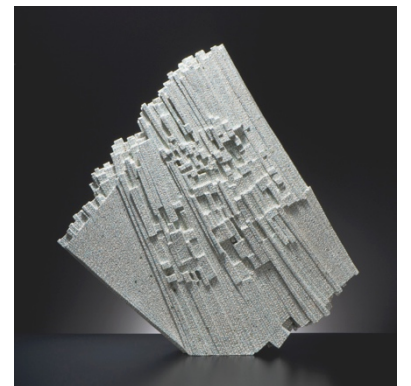
Compilation of Recollected Images 2017 Shigaraki stoneware with colored-clay chamotte inlays 26 3/4 x 25 1/8 x 5 1/8 in.