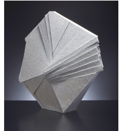
Compilation of Recollected Images 2017 Shigaraki stoneware with colored-clay chamotte inlays 24 3/8 x 26 3/4 x 8 1/4 in.

These latest sculptures resemble – not merely the walls and materials of specific structures – but on a grander scale, actual cityscapes. These works conjure up the bracketed roofs, sloping eaves, rhythmic patterns and stone or tile floors of the temples, shrines and buildings in her historic home of Kyoto or reference the iconic scenery and costumes of the Noh theater.