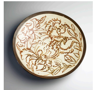
Ishiguro Munemaro Bowl with Drawn Patterning, 1949-1950 3 x 13 7/8 in.