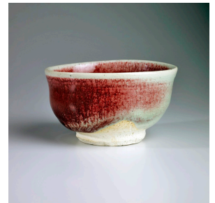
Tanaka Sajirō Copper red-glazed Teabowl with Kiln Effects , 2016 3 x 5 x 5 1/4 in.