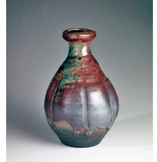
Tanaka Sajirō Copper red-glazed Sake Bottle with Kiln Effects , 2015 9 1/8 x 6 1/8 in.

Joan B. Mirviss LTD is located at 39 East 78th Street in New York and is open Monday through Friday 11am-6pm and by appointment. For more information or to request high-resolution images, please call 212-799-4021 or email director@mirviss.com . For the full online exhibition brochure, please visit our website at www.mirviss.com .