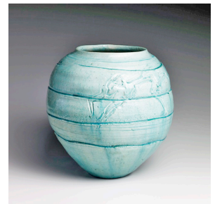
Ishiguro Munemaro Pale Green-Glazed Vessel "Frolicking Water Sprite", late 1960s 8 1/2 x 8 1/2 in.