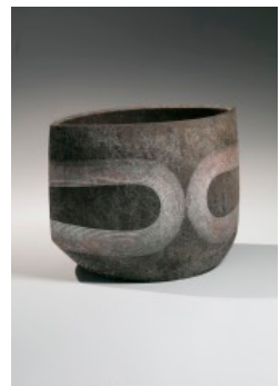
Iguchi Daisuke (b. 1975) Sloped ovoid vessel with silver meander patterning 2017 Glazed stoneware