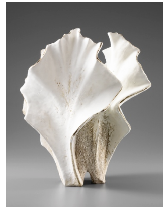
White Form 2018 Glazed stoneware 15 3/4 x 13 x 13 3/8 inches

For further information on or images from Shifting Rhythms: The Sculpted Moments of Koike Shōko , please call 212-799-4021 or email admin@mirviss.com