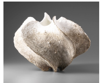
White Form 2018 Glazed stoneware 9 7/8 x 13 inches