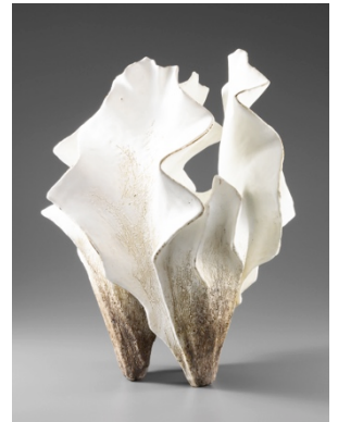
White Form 2017 Glazed stoneware 20 1/2 x 15 3/3 inches

Growing up, she was surrounded by creativity. Her mother, Koike Chie (1916-2014) was an internationally recognized fashion designer who had studied in Paris and was, for many decades an enormously influential and inspiring teacher at Bunka Fashion College. Thus, Koike Shōko's childhood was spent in a whirl of textiles and women's fashion, immersed in the intersection of color, pattern, and form, to the extent that upon reaching university she decided to evoke the same energy through a new medium: clay. As one of the first female graduates from the prestigious ceramics department of the Tokyo National University of Fine