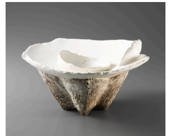
White Form 2016 Glazed stoneware 7 1/2 x 13 x 12 5/8 inches