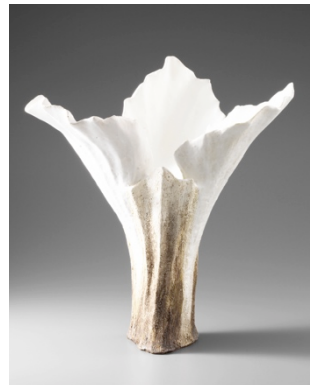
White Form 2017 Glazed stoneware 21 1/4 x 18 7/8 x 13 3/4 inches