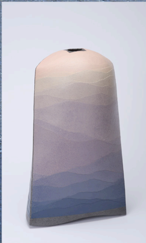
Rising Air 22 x 13 3/4 x 8 inches

"In each work, my intention is to create a delightful musical performance — a harmony of color blending with a restrained sense of the clay — becoming a canvas for evocative tranquil landscapes."