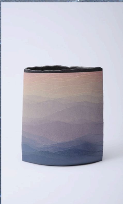
Gust of Wind 12 1/2 x 10 3/4 x 5 3/4 inches