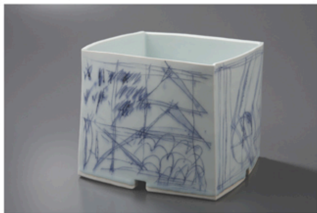
Kayoh 8 1/4 x 11 3/8 x 11 3/8"