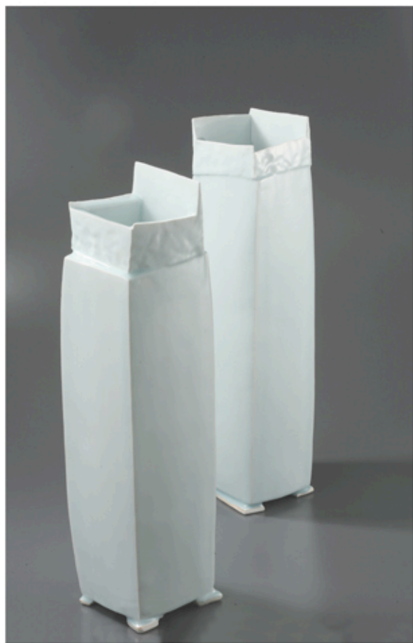
LEFT Kayoh 28 1/8 x 7 5/8 x 7 7/8"