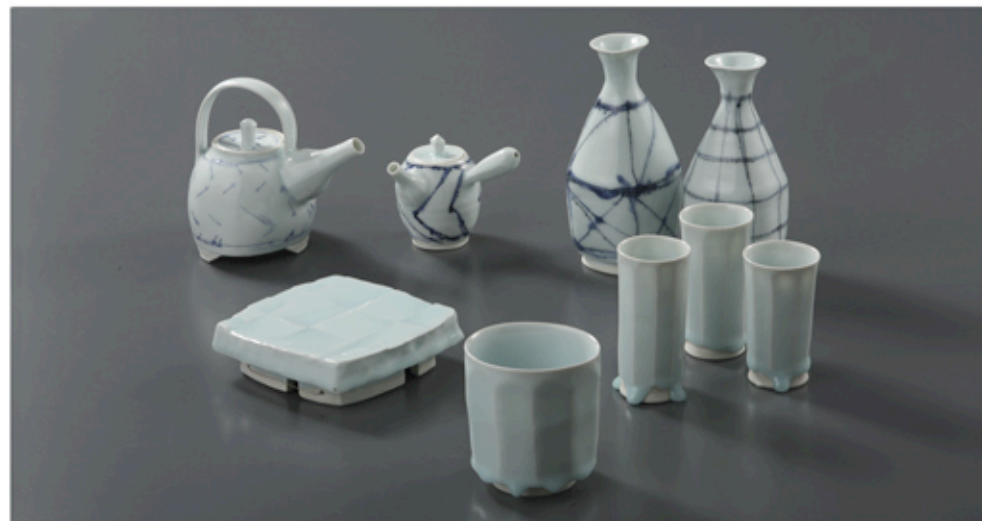
Tea pots, tea cup, footed plaque, tokkuri and guinomi

Based in Tokoname, a region rich in ceramic history, the internationally celebrated artist Yoshikawa Masamichi (b. 1946) draws inspiration from ancient Chinese ceramic forms and glazes. Working in porcelain, he creates strikingly modern reinterpretations of these structures and covers them in dripping seihakuji (blue-white) glaze. His functional material is artfully painted with fanciful abstract designs in sometsuke (cobalt blue underglaze).