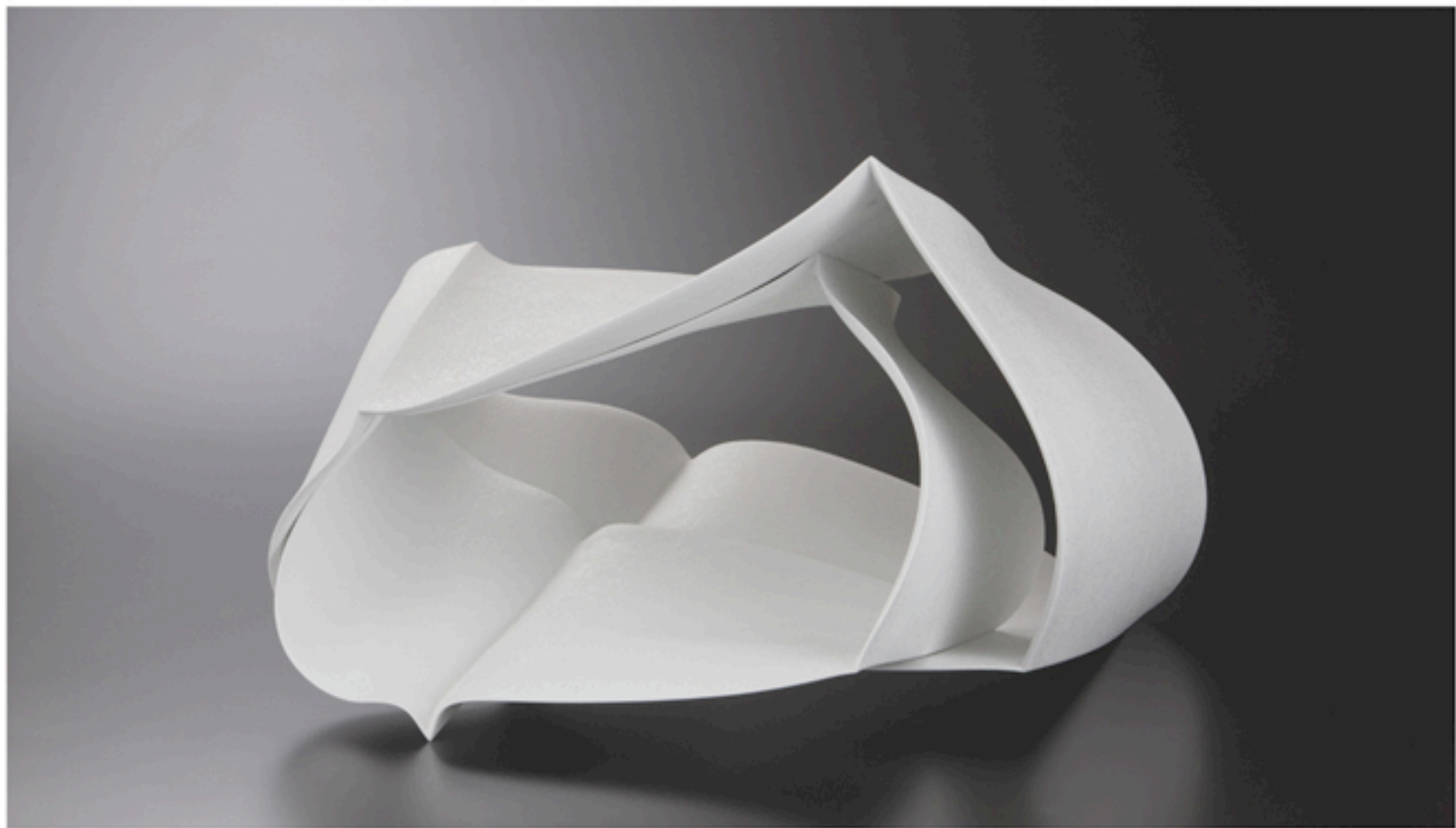
Forms in Succession #5

15 \frac{1}{2} x 20 x 17 \frac{1}{2} inches