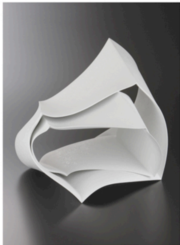
Forms in Succession #8 12 \frac{1}{2} x 14 \frac{1}{2} x 17 \frac{1}{2} inches

FRONT Forms in Succession #4 14 \frac{1}{2} x 19 \frac{1}{2} x 20 inches BACK Forms in Succession #2 10 \frac{1}{2} x 10 x 12 inches