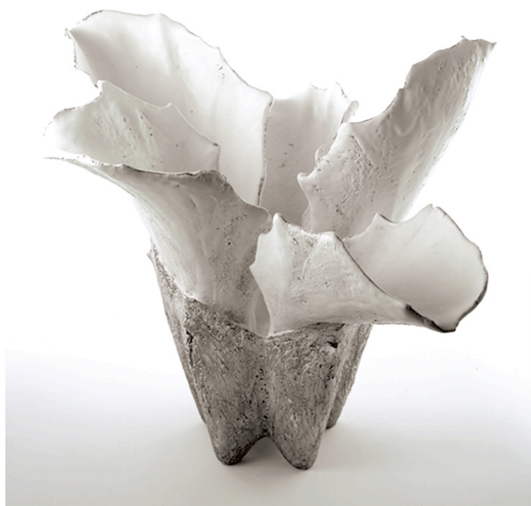
White form 2008 22 x 30 x 23 3/4"