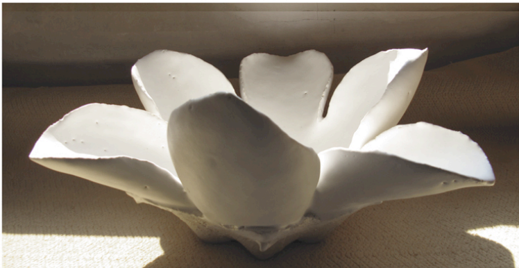
White form, 2007

Cleveland Museum of Art Contemporary Art Museum, Houston Clark Center for Japanese Art and Culture, Hanford, CA Hamilton Art Gallery, Victoria, Australia Mary and Jackson Burke Foundation, NY Metropolitan Museum of Art Minneapolis Institute of Arts Musée national de céramique, Sèvres Museum of Arts and Design, NY Museum of Fine Arts, Boston Museum of Oriental Ceramics, Osaka National Museum of Modern Art, Tokyo Shigaraki Ceramic Cultural Park, Shiga