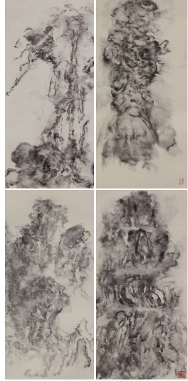
"Land of Immortals," from left to right: Green Dragon White Tiger, Vermillion Phoenix, Black Tortoise and Snake , ink on paper, 66×33 cm (each scroll), 2021.