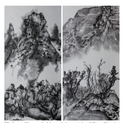
"Taihang Rhapsody," from left to right: White Clouds and Dark Beasts, Sound of the Empty Valley, ink on paper, 138 ×69 cm (each scroll), 2021.