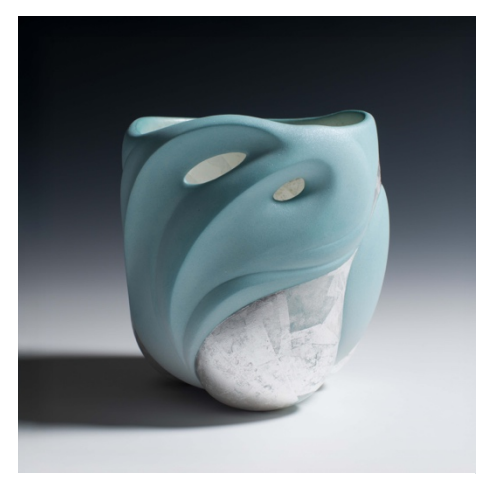
Sky in a Parallel Universe 2025 Glazed stoneware with silver leaf 4 3/4 x 4 3/8 in