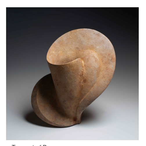
Trumpet of Dawn 2024 Glazed stoneware 16 5/8 x 15 1/4 x 8 1/4 in