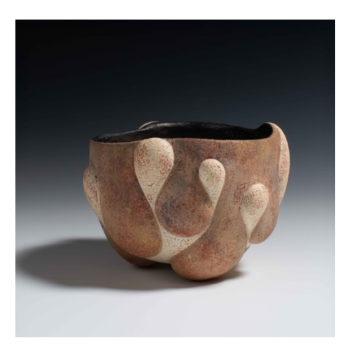
Emerging Glimmer 2024 Glazed stoneware with gold leaf 3 5/8 x 5 in