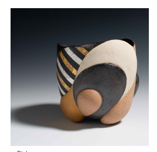
Style 2024 Glazed stoneware with gold and silver leaf 4 3/8 x 4 1/4 in

For more information, please contact us at 212-799-4021 or director@mirviss.com.