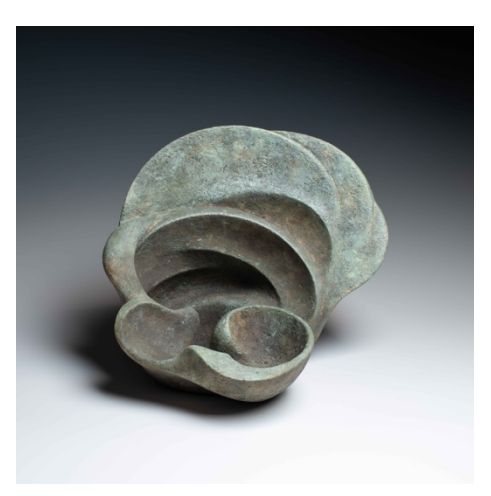
Pulse of Earth 2024 Glazed stoneware 10 x 12 3/8 x 9 5/8 in